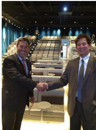
The 21st Annual Restaurant Trends Seminar took place on Tuesday, May 7, 2013 at the Revere Hotel in Boston. RIW and co-sponsors: Cafco Construction ; The Boston Restaurant Group ; and USI are pleased to announce a portion of the proceeds was donated to the Future Chefs organization.