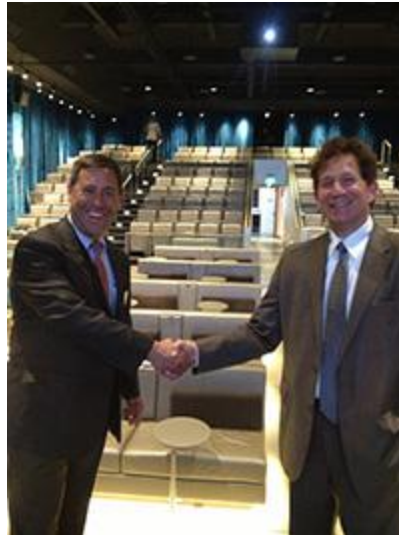
The 21st Annual Restaurant Trends Seminar took place on Tuesday, May 7, 2013 at the Revere Hotel in Boston. RIW and co-sponsors: Cafco Construction ; The Boston Restaurant Group ; and USI are pleased to announce a portion of the proceeds was donated to the Future Chefs organization.